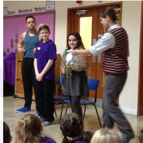
Year 2 children enjoying stories on World Book Day